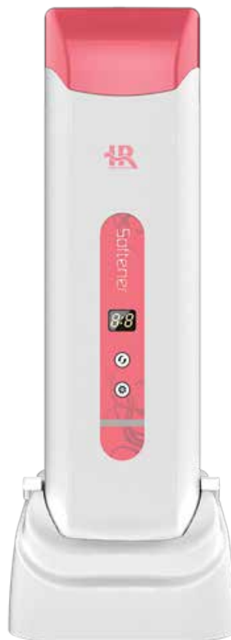
M1B1, M1B3, M2B5