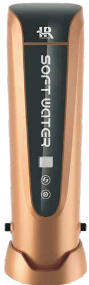
M1A1, M1A3, M2A5